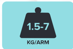
Load Capacity 1.5-7 Kg/Arm