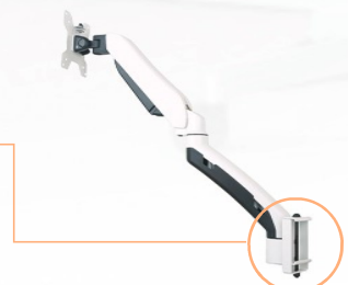
AVA20-TBM | Buy this module to mount any AVA20-series monitor stands below to toolbar